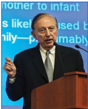
Dr. Robert C. Gallo, Director, Institute of Human Virology