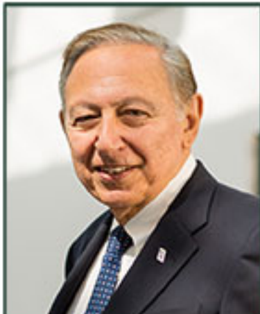
Dr. Robert C. Gallo, Director, Institute of Human Virology